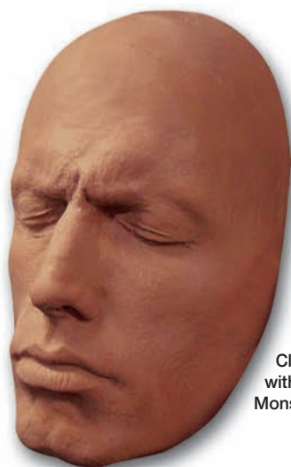
Clay lifecast poured with Premium Grade Monster Clay